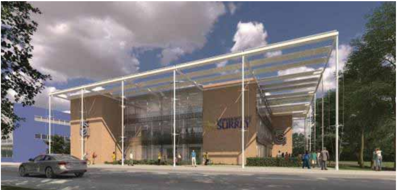
Figure 3: Artist's impression of the 5GIC

network capable of meeting tomorrow's needs. The focus will be on developing intelligent systems that work together to give the impression of unlimited data capacity, providing a network that is far faster (low latency) than today's 4G system, with greater energy-efficiency and reduced end-user costs.