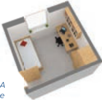
Band A - single