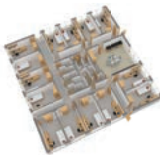
Band C - typical flat floor plan

The rooms are located on floors sharing kitchens and showers, mostly in groups of ten to fourteen.