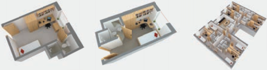
Band D - typical flat floor plan

At our student village of Manor Park, each flat is home to five to nine students sharing a well equipped kitchen-dining room. There's a regular University subsidised bus service to and from campus. All band D rooms have an en-suite shower room with toilet and washbasin.