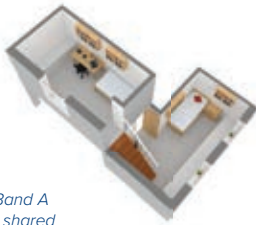
Band A - shared