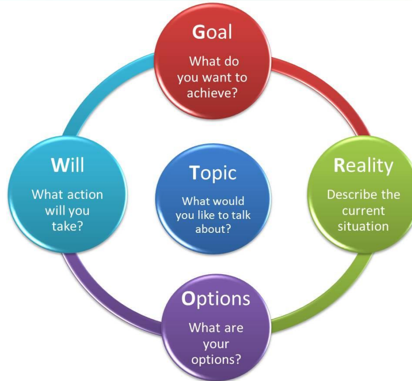
The GROW Model