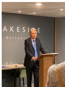
Rt Hon Lord Philip Hammond of Runnymede