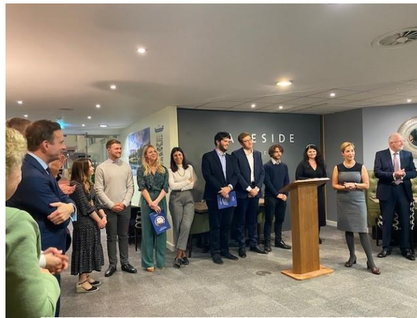
Members of the research team

The CBE produces its innovative and enlightening research by championing student-led content; students are invited to participate in research, analysis, co-authoring articles, blog writing and vlog creating, and participating in public CBE events. These opportunities engage University of Surrey students and build a variety of skills, experience, and connections.