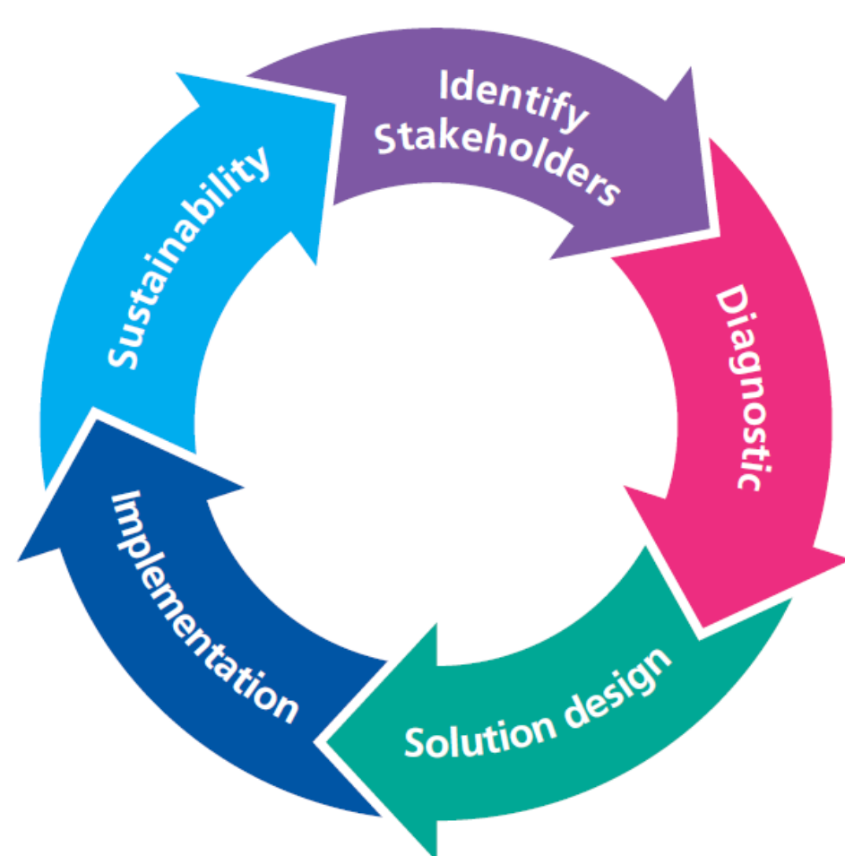
Figure 2: National Transition Nursing Network Implementation in four regions across the UK