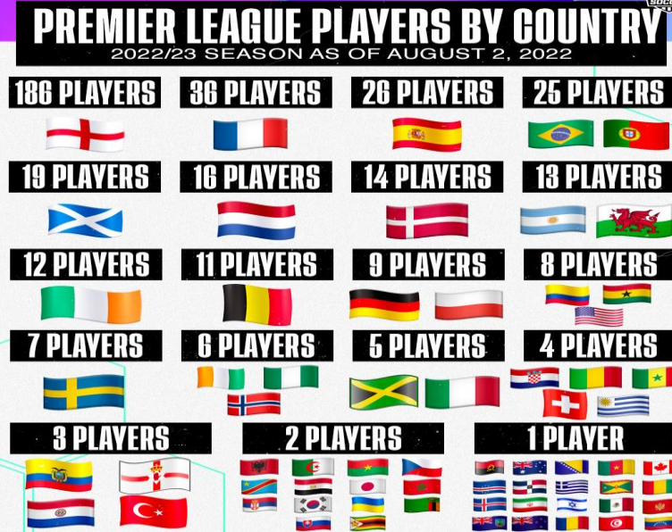
Fig. 3 – Premier League nationalities (66)