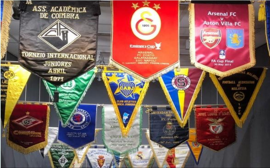
Fig. 2 – Entrance to Arsenal Museum

- Recent globalisation has caused cultural shifts, especially tensions between global and local cultures - Cultural flows - growth in foreign influence and consumption - Football also a specialised language - Interaction between global and locally embedded football cultures feeds into global vocabulary - catenaccio, libero etc. - This also reflects massive influx of foreign professionals – now 'more than double the original number' who took part in inaugural Premier League season (1992/3) (Allen, 2022)