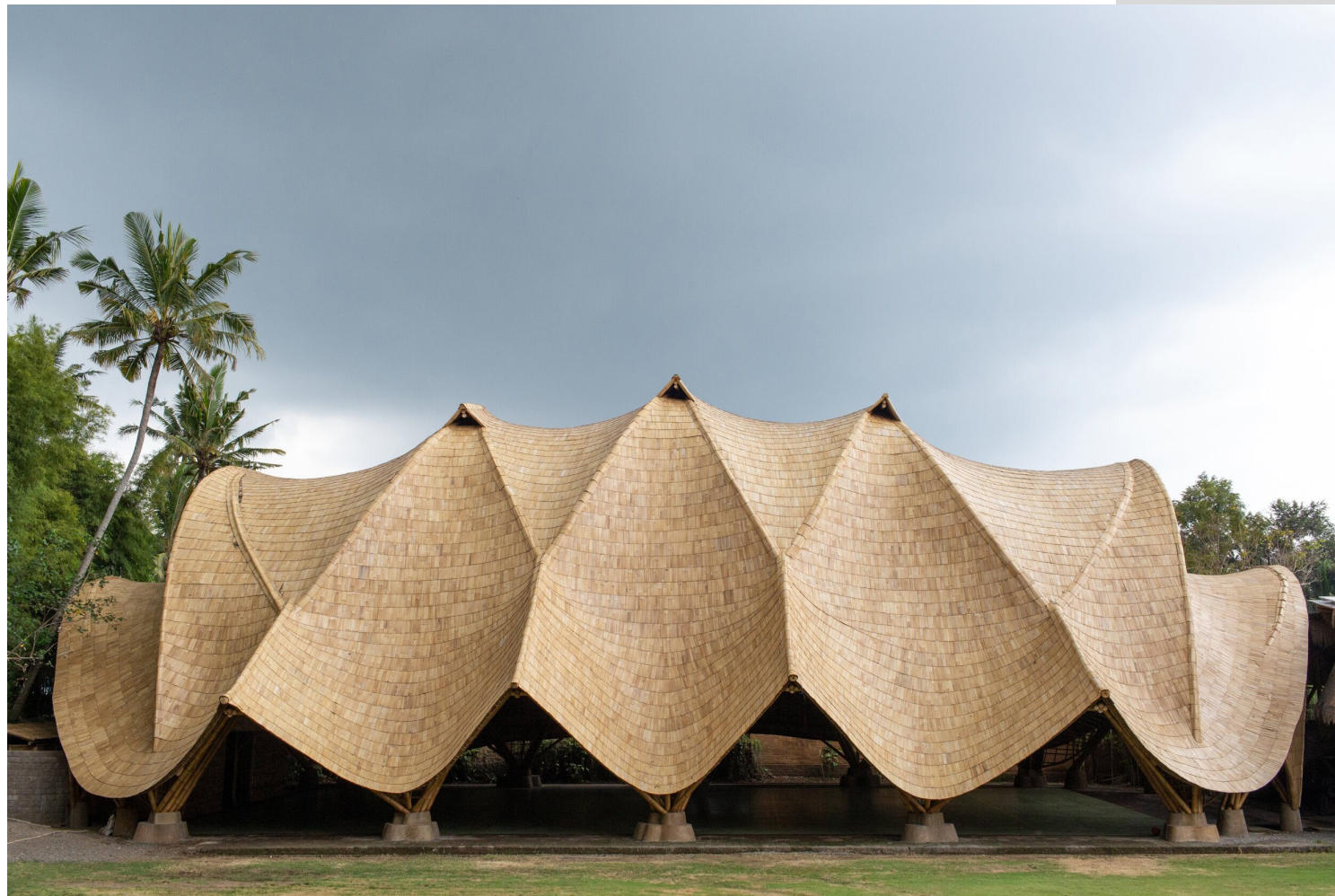
The Arc – Green School Gymnasium, Bali, Indonesia