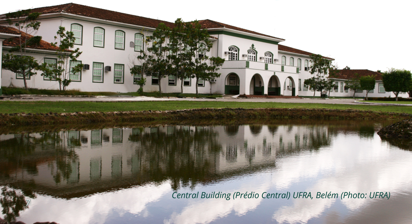
Central Building (Prédio Central) UFRA, Belém

If you are an early career researcher in the UK or Brazil, you may be eligible to receive the British Council funding to cover the costs related to the participation to the workshop. The funding could contribute towards the workshop registration fees, travel (both, international and local), accommodation in Belém and meals. Please complete the APPLICATION FORM attached to this flyer and email it to ssrc@surrey.ac.uk . Applications will be considered on a first come, first serve basis for this limited available fund. PhD candidates who are awaiting the results of their viva are eligible to apply for funding.